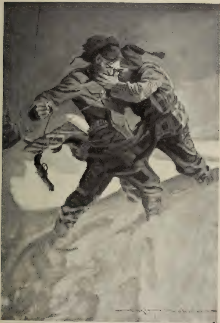
But the blow lacked force